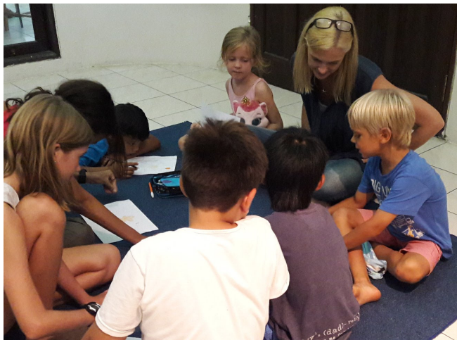
Teachers and Staffs

We believe teachers should not only teach knowledge. In our home-school community experts and practitioners from various countries share their knowledge, skills and experiences.